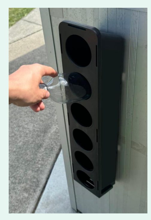
Vertical (Recycled Plastic)